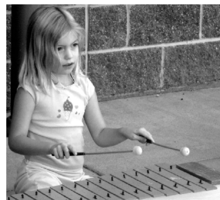
Orff Class at Fall Workshop