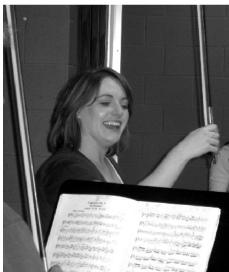
Bowing technique class